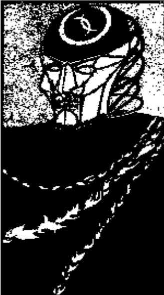
Ren the Unclean

Ranks : Command 30 (40) Agent 0 Emissary 20 Mage 50 Health 100 Stealth 30 Challenge 72 Artifacts : #54 Helm of Sen Jey #111 Believer's Bane #112 Burning Blade Spells (+0) : #106 Deflections(77) #108 Blessings(78) #236 Fire Storms(60) #308 Capital Return(81) #413 Scry Population Center(96)